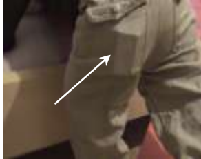
Figure 1. A 2-year old child having the sensor device in the back-pocket of the trouser.

detection. Most of the errors are obtained from the confusion between walking (1) and running (3). This can be explained by the fact that sometimes it is difficult to distinguish between walking quickly and running. To solve this issue, additional classes can be introduced to better describe the speed and the intensity of walking and running. Figure 3 shows an example of a sensor signal (AccMag) and the obtained classification result as a function of time. The output of the classification (in red) is according to the labels in Table 1.